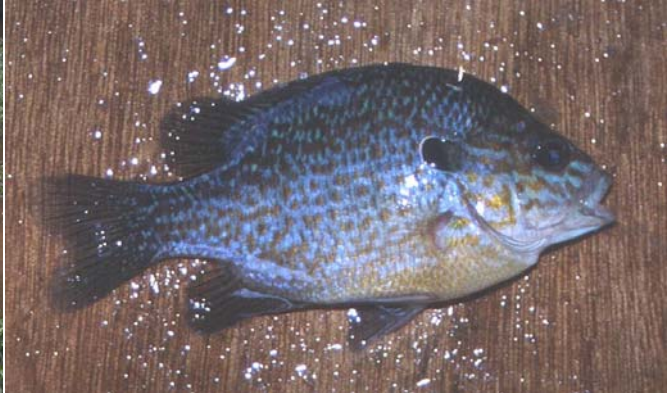
This colorful longear sunfish is but one of the many species collected from Bayou Bartholomew this summer.

Bayou Bartholomew Alliance 7233 Camden Cutoff Rd. Pine Bluff, AR 71603