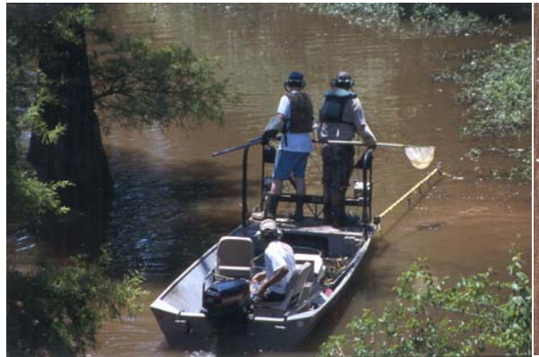
Employees of Layher BioLogics and the Arkansas Game and Fish Commission use an electrofishing boat to sample fish in Bayou Bartholomew.

A portion of the grant monies received last year from the Arkansas Soil and Water Conservation Commission funded fish sampling throughout the month of June at seven sites on Bayou Bartholomew. Sites ranged from the city of Pine Bluff downstream to Garrett Bridge in Lincoln County. The fish were collected using boat and backpack mounted electrofishing units. The purpose of the work is to evaluate the effects of the BBA's efforts to improve water quality in the watershed. Fish population densities and species diversity will be calculated for each site. Additional samples will be taken in the summer of 2001. The results will be compared to similar studies at the same sites in 1992-1994 to determine if improved water quality has led to an improved fishery. This summer's work has yielded 53 species from the seven sites. The work was carried out by Layher Biologics RTEC, Inc. of Pine Bluff. Donations of time and equipment were made by the Arkansas Game and Fish Commission, the Arkansas Soil and Water Conservation Commission, and the Arkansas Department of Environmental Quality.