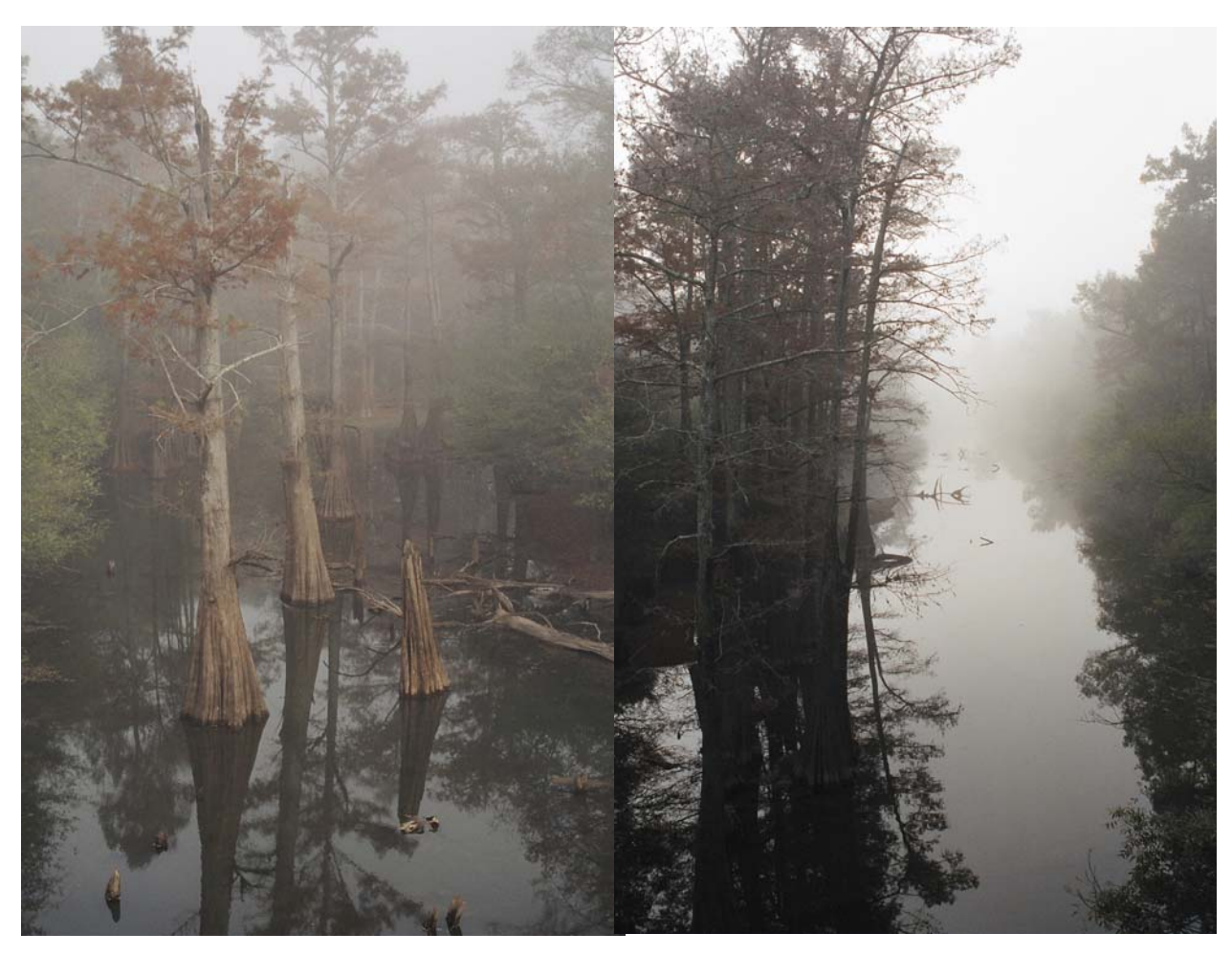
Mist rises over the Bayou Bartholomew in Drew County on a cool fall morning.