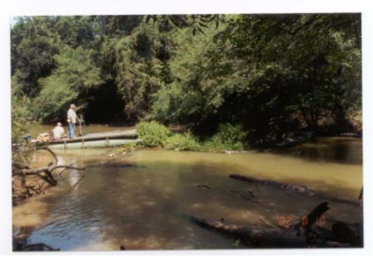
Volunteers open the bayou at Parkdale..

By opening the logjams, we hope to prevent the stream from cutting banks and causing excessive erosion. Logjams are not totally removed. Logs can be used to armor banks and also provide great fish habitat. But opening a path through these can also allow the floater a great view of the world's longest bayou.